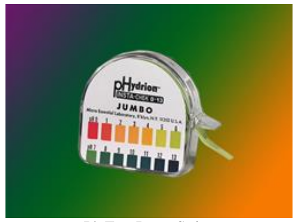
Ph Test Paper Strips

I test my saliva in the morning before I have brushed my teeth or eaten anything.