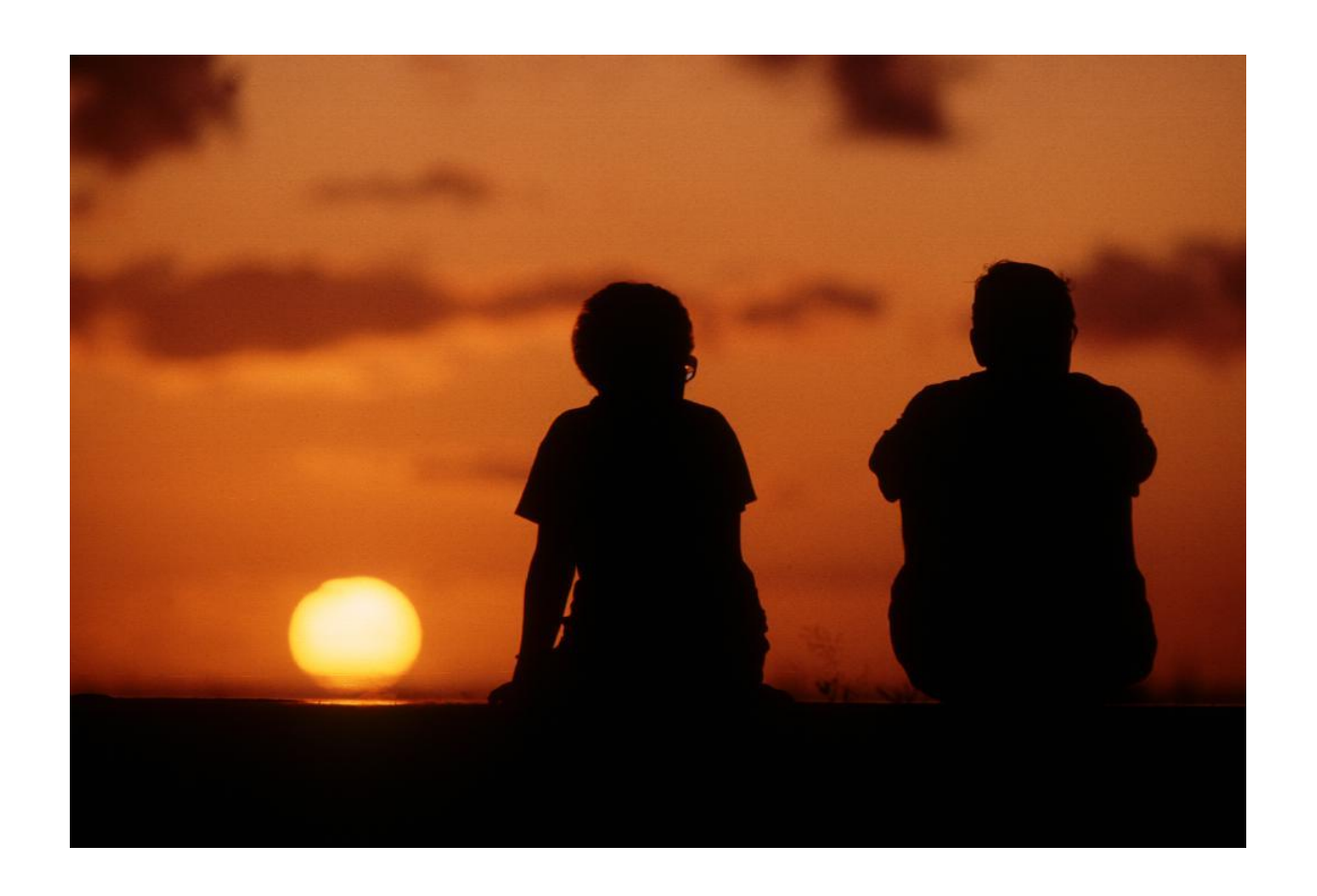
Seven Natural Cancer Remedies That Are Effective, Inexpensive, And Readily Available