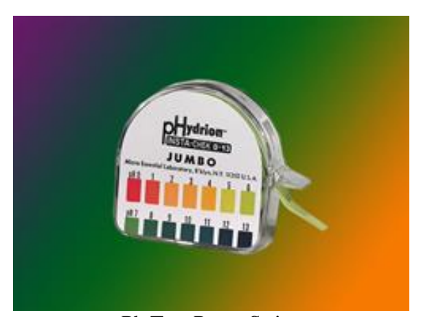
Ph Test Paper Strips

I test my saliva in the morning before I have brushed my teeth or eaten anything.